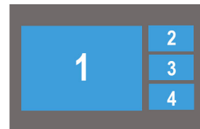
Vid1 + Vid2 + Vid3 + Aud1 + Slides

Presentation Add-ons (Available only to Faculty and Staff with My Mediasite accounts)