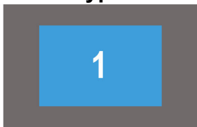
Video 1 + Audio 1

Presentation Type: TRI OR QUAD SCREEN OPTIONS AVAILABLE ONLY IN MFC FORUM